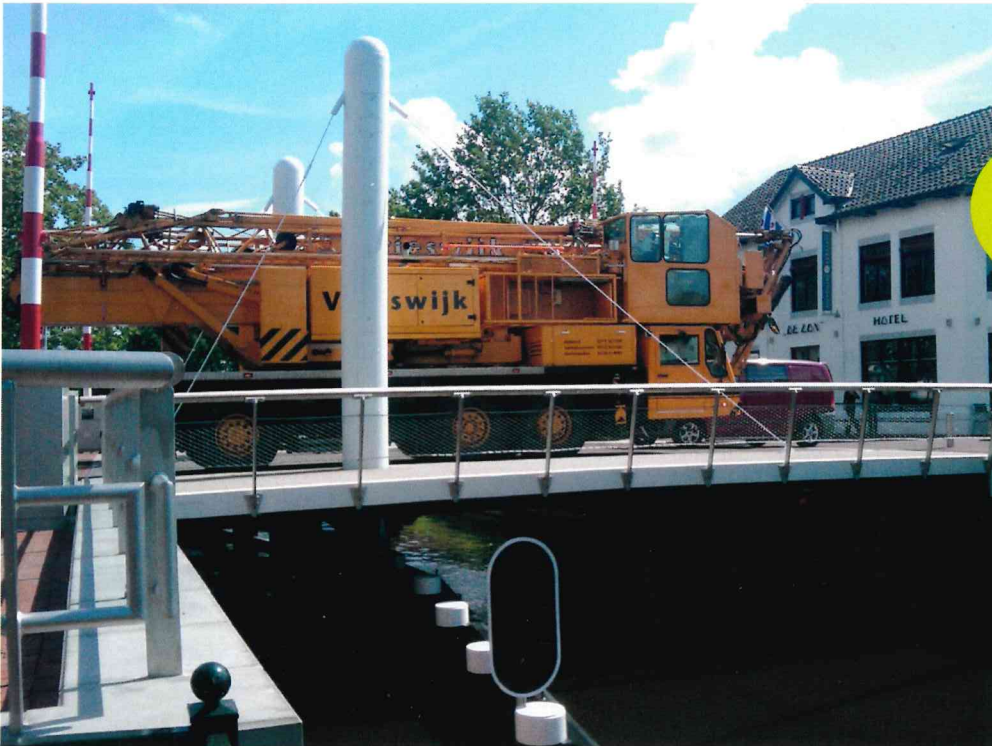
The first fully FRP lifting bridge in the world, spanning 12m, with an InfraCore® Inside deck built by FiberCore Europe.

InfraCore® Inside is FiberCore Europe's proprietary technology to construct strong, lightweight and durable structures in fiber reinforced polymers (FRP, or composites). FRP is a well-known material, with significant advantages over steel, concrete and timber: