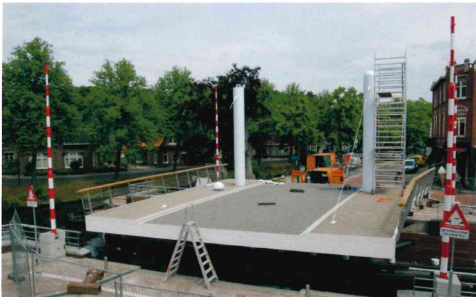
The bridge in Oosterwolde under construction. The pylons are covers to the hydraulic lifting mechanism.