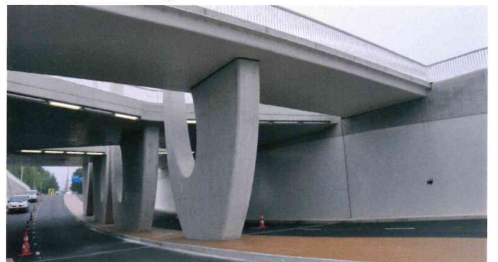
InfraCore® Inside road bridges in Amersfoort, resting on a concrete substructure.

For more information please visit our website or contact us: